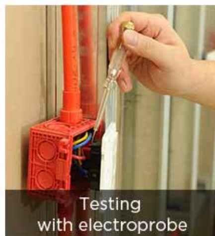
Testing with electroprobe