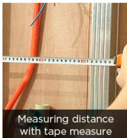
Measuring distance with tape measure