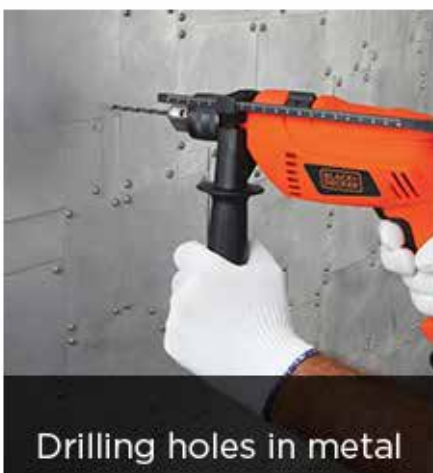
Drilling holes in metal